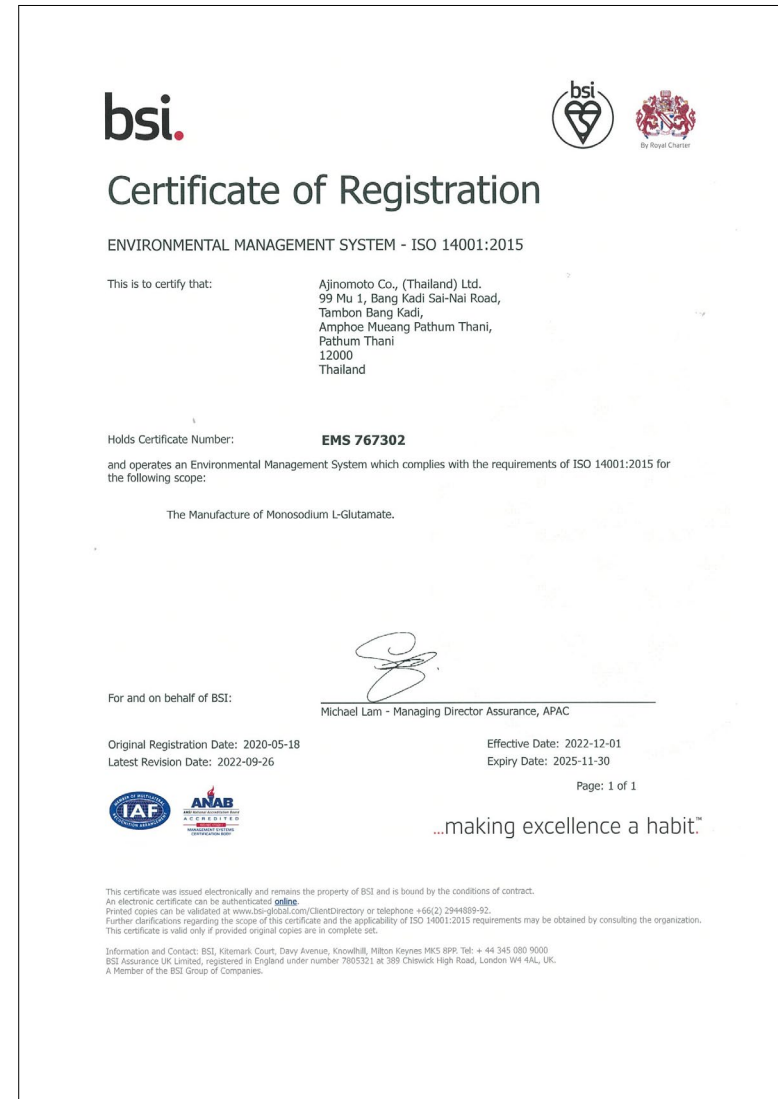
Certificate of Registration AJINOMOTO CO., (THAILAND) LTD., Pathum Thani factory