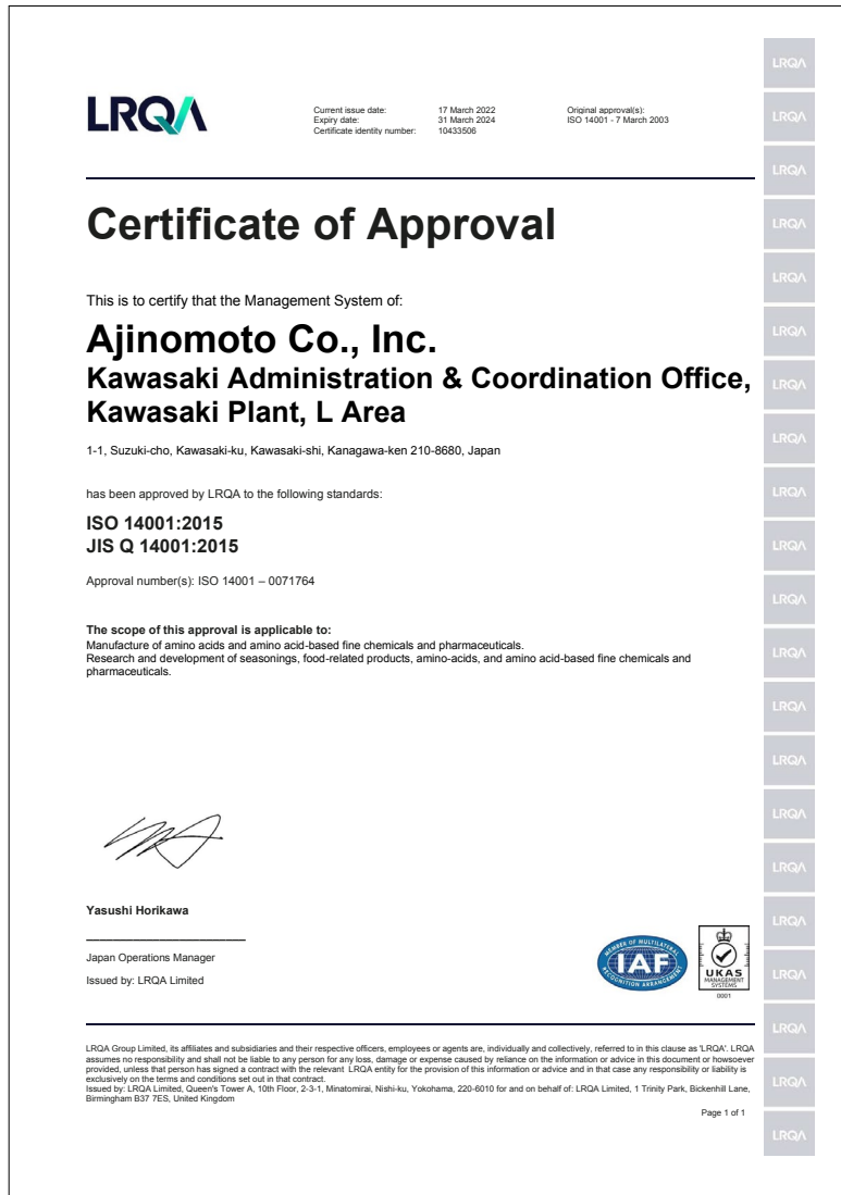
Certificate of Approval Ajinomoto Co., Inc. Kawasaki Administration & Coordination Office, Kawasaki Plant, L Area