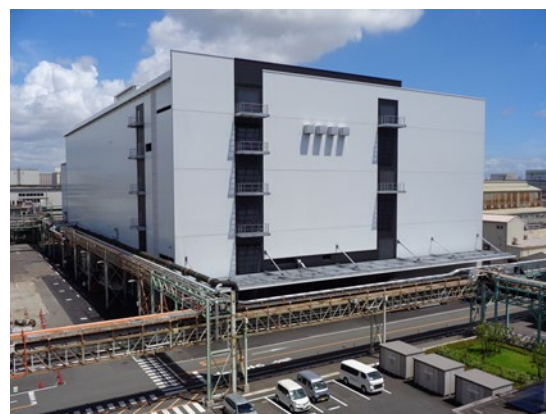
Exterior view of the new plant

TOKYO, October 1, 2021 – Ajinomoto Co., Inc. (“Ajinomoto Co.”) has completed construction of a new plant that will carry out integrated manufacturing and packaging of soups ( Knorr® Cup Soup , Knorr® Soup DELI® , etc.) at the Kawasaki Plant of Ajinomoto Food Manufacturing Co., Ltd. on the premises of the Kawasaki Administration & Coordination Office. This is in accordance with the details announced in the press release “Ajinomoto Group to Restructure Seasonings and Processed Foods Production System in Japan,” dated September 29, 2017. Total investment was approximately JPY 20 billion. Following the start of packaging operations in April 2021, the plant will implement integrated manufacturing and packaging at all packaging lines as of October.