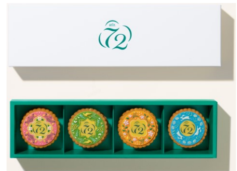
Atr.72™ Flowering Mooncake (Gift Box)

TOKYO, August 9, 2024 – Ajinomoto Co., Inc. (“Ajinomoto Co.”) will embark on a new food business starting from Singapore, with the launch of the new brand Atr.72™ (Atelier Seven Two) proposing new food lifestyles that incorporate the blessings and beauty of nature in everyday eating occasions while actively utilizing environmentally-conscious ingredients (plant-based, cell-based, microbial-based, etc.) through its Green Food business. The first phase of the launch will be a limited-period sale of mooncakes using the air-based protein Solein® at Takashimaya in Singapore from Monday, August 12, 2024.